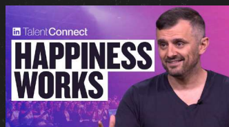
LinkedIn TalentConnect Keynote, 2020