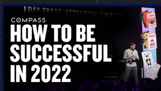
Compass Real Estate Keynote, 2022