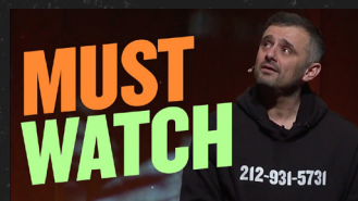
NAC New Jersey Keynote, 2019